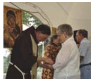
PILGRIMAGE FOR PEACE PAGE 4