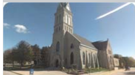
St. Mary of the Angels