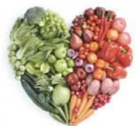
HEALTHY EATING TIPS PAGE 6