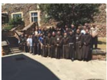
SPUTY STATEMENT 2016 PAGE 3