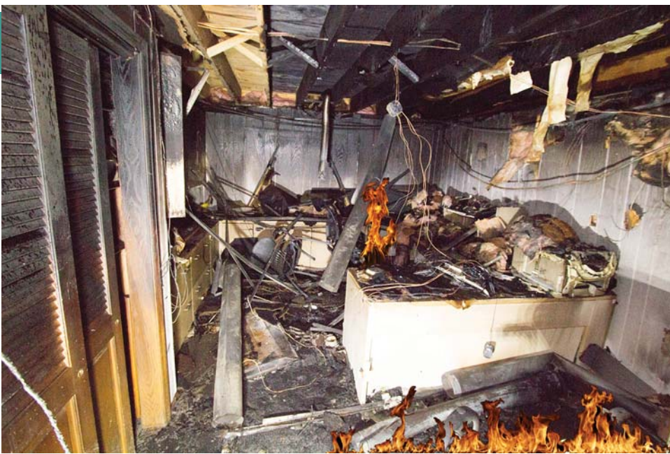
Fire damage, General Secretariat of the Franciscan Missions, Waterford, Wisconsin

The fire at the Mission Office occurred early morning on July 21, 2016. It is speculated the cause was an over-heated ceiling fan.