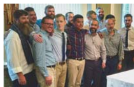
NEW NOVICES PAGE 4