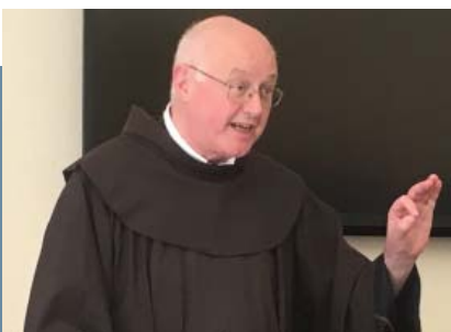
Provincial's Meeting (right)