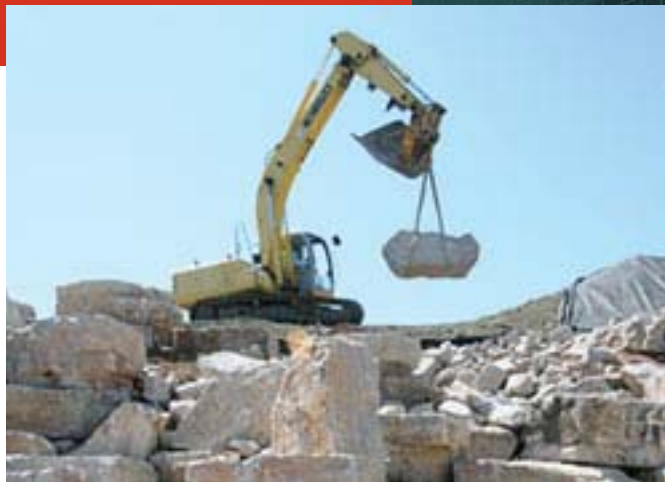
Making Mt. Sinai in St. John, Indiana

When you make a trip to visit the Friars at Lourdes Friary, Cedar Lake, make sure you stop to see the two shrines; Stations of the Cross and the Ten Commandments. Also, visit a very fine gift shop.