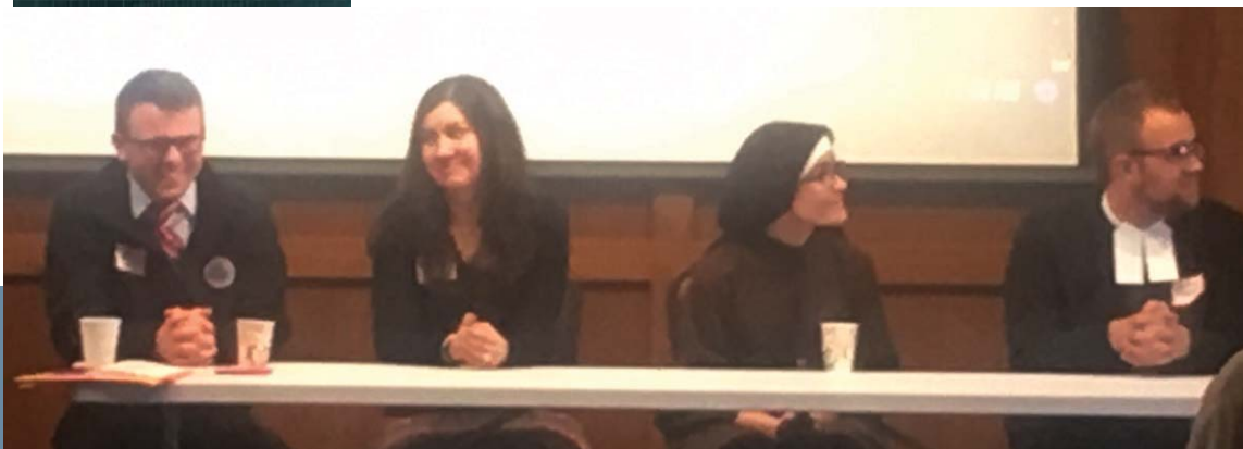
Panel members, April 1, 2016, Chicago Archdiocese sponsored discussion of religious vocations with Major Superiors of Women and Men.

Initial details for the Fall Meeting of the ESC, hosted by St. Joseph Province, Eastern Canada, October 10-14, 2016