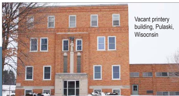
Vacant printery building, Pulaski, Wisconsin