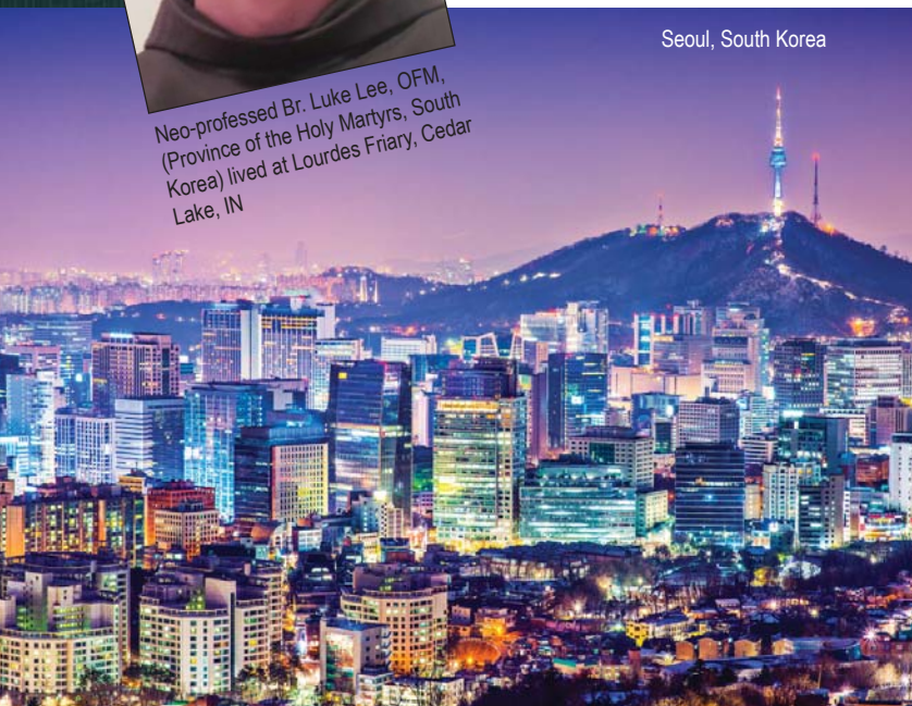
Seoul, South Korea