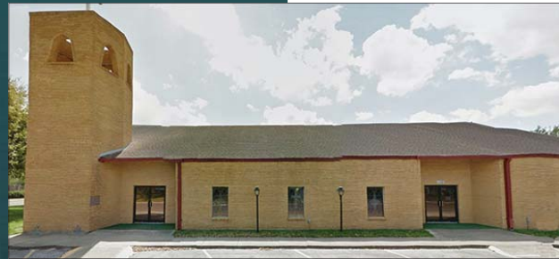
Holy Family Parish, Edinburg, Texas