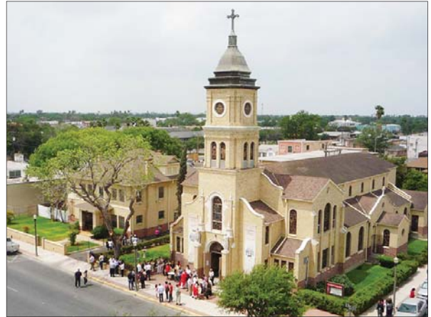
Sacred Heart Parish, McAllen, Texas